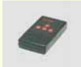
Remote control unit